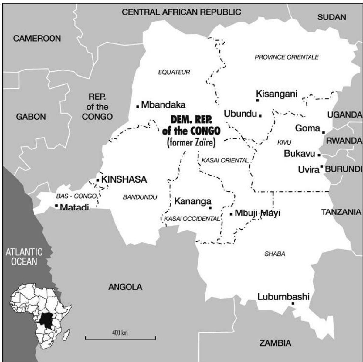
Map of Democratic Republic of the Congo. Country names and borders on this map are intended to facilitate reference and have no political significance