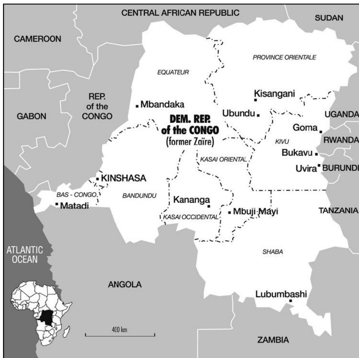
Map of Democratic Republic of the Congo. Country names and borders on this map are intended to facilitate reference and have no political significance