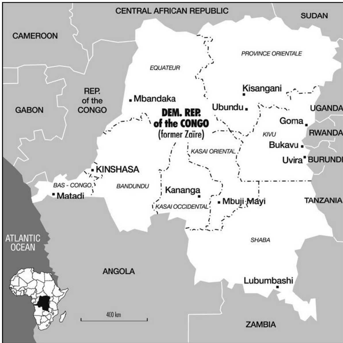
Map of Democratic Republic of the Congo. Country names and borders on this map are intended to facilitate reference and have no political significance